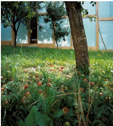
biohotel apple orchard